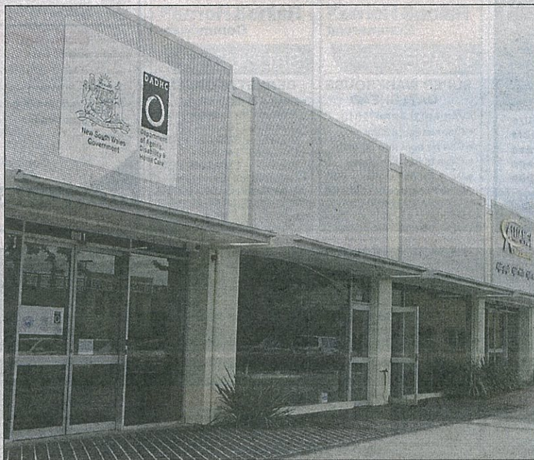
SYNDICATE SIGNS ON: The Maitland Central commercial complex on Ken Tubman Drive has been bought by a group of Sydney investors.

HUNTER New England Area Health Service is auctioning three adjacent properties on Main Road,